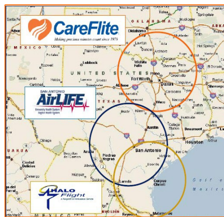
Reciprocal Membership Benefits

CareFlite membership coverage areas shown above plus Ground Ambulance and/or 911 EMS service is currently offered in all or portions of the following counties: Collin, Dallas, Denton, Ellis, Erath, Hill, Hood, Johnson, Kaufman, Palo Pinto, Parker, and Tarrant. No service offered to/from Mexico. CareFlite's Membership Program's air benefits are honored by Air Life and Halo Flight in their service areas. Your membership covers any CareFlite ambulance transport regardless of originating location.