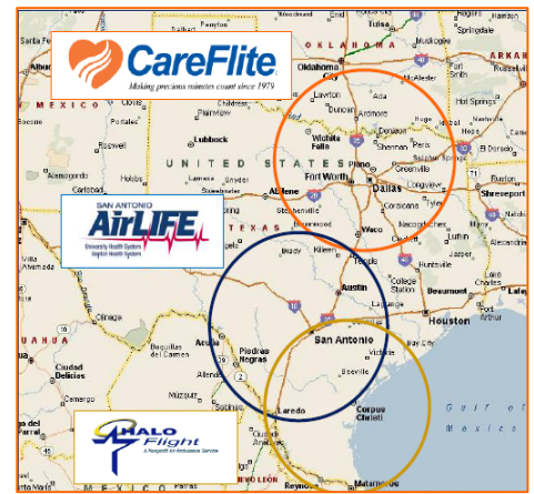
Reciprocal Membership Benefits

CareFlite membership coverage areas shown above plus Ground Ambulance and/or 911 EMS service is currently offered in all or portions of the following counties: Collin, Dallas, Denton, Ellis, Erath, Hill, Hood, Johnson, Kaufman, Palo Pinto, Parker and Tarrant. No service offered to/from Mexico. CareFlite's Membership Program's air benefits are honored by Air Life and Halo Flight in their service areas. Your membership covers any CareFlite ambulance transport regardless of originating location.